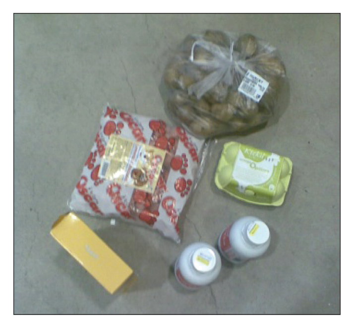
Figure 4. Solid waste sterilization test load.

Regardless of the processing method – batch or continuous – solid particles should be removed from the effluent stream and sterilized separately; even smaller particles than 10 mm in diameter. Larger particles such as carcass parts are usually sterilized and disposed of by using specific alkaline hydrolysis-based tissue digesting systems or incinerators. Solids can include any solid or slurry process residue such as carcass and tissue remains, proteins, agars, coagulated media (blood etc.), animal cage residues (bedding residue, food remains, feces, hair) among others. Direct steam injec-