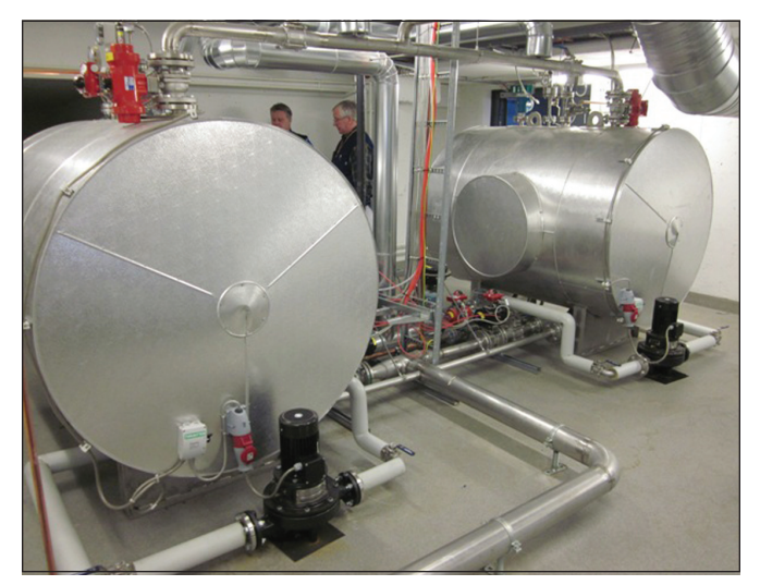
Figure 2. Batch decontamination system.

Effluent is either pumped or gravity drained to a collecting vessel. When the vessel is full, the decontamination process can begin by heating up the vessel content by either direct steam injection, heating coils, or jacket heating. If effluent treatment is to be non-interrupting, at least two vessels or more are needed to enable continuous effluent collection ability, depending on the facility daily output and peak maximum flow. After reaching the decontamination set point, the decon-